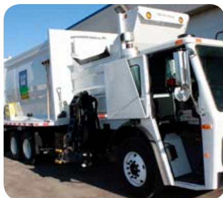
Photo of new garbage truck. The trucks no longer have an opening at street level that would allow operators to throw items directly into the vehicle.

Previous instructions stated that all items placed curbside for unlimited collection must be smaller than four feet in length and less than 50 pounds. Items placed curbside for unlimited collection must now be small enough to fit inside the garbage cart. Bundled material for collection (including cardboard for