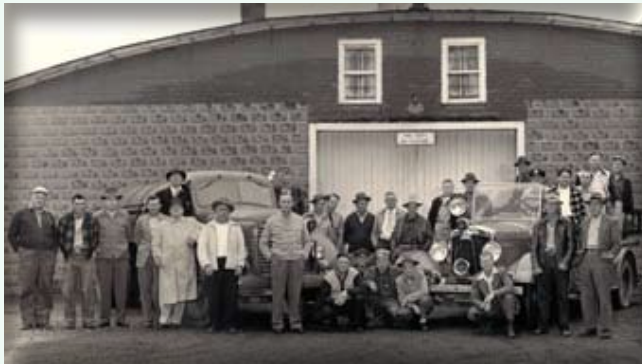
Photo of the Town of Pleasant Prairie Volunteer Fire Department in 1950. The building in the background, a former potato barn, served as the fire department building at the time.