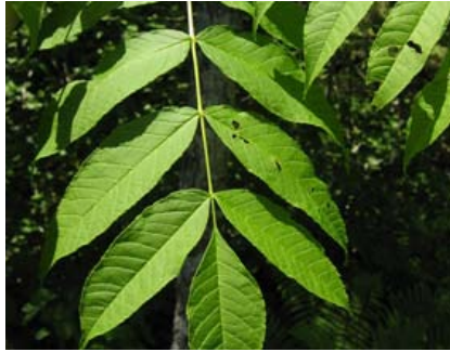
Photo of ash tree foliage described in text at lower left.

To know if you could be impacted by the Emerald Ash Borer, it is important for you to know how to identify both the tree and the presence of the pest. Ash trees should be budding out at this time of year. Look for the opposite branching pattern - two branches coming off of a main stem, one on each side, directly opposite each other. Ashes have many small dots (vascular bundles) on their leaf scars, forming a semi-circle or crescent pattern. Buds and leaf scars are opposite one another on twigs. White and green ashes have thick, diamond-patterned bark, while black ash bark is thin, ashy-gray and scaly. If leaves are present, they will appear as compound leaves with 5-11 leaflets. (See photos at right.)