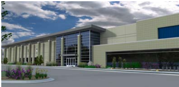
Rendering of the RecPlex Aqua Arena courtesy of Partners In Design Architects, Inc.

Please join us on Thursday, June 10 at 3:00 p.m. for the dedication and grand opening of the new Olympic-sized pool at RecPlex. The event will feature a brief dedication ceremony and tours of the facility. Frozen custard will be served courtesy of Culvers of Pleasant Prairie . Parking for the event will be available on the south side of the facility in the RecPlex parking lot. The Aqua Arena entrance is the western most set of doors on the southern face of the building.