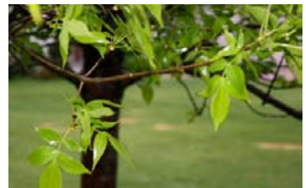
Image of young ash tree showing opposite branching pattern and compound leaves.

Village staff has asked the contractors bidding on the work to extend the same bulk rate (that the Village will pay for the treatment of ash trees) to residents for the treatment of ash trees that are on their own property and outside of the Village right of way. Please see page 8 for more information regarding participation in the preventative treatment program. □